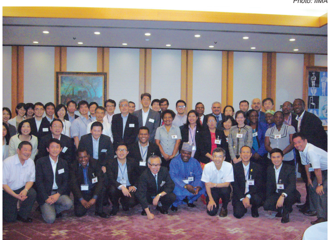
JICA trainees visiting our institute