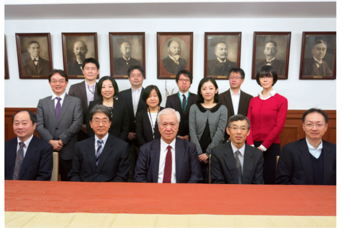
Current active members of the IIMA (and photos of founding fathers)