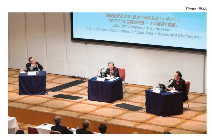
Recent IIMA symposiums